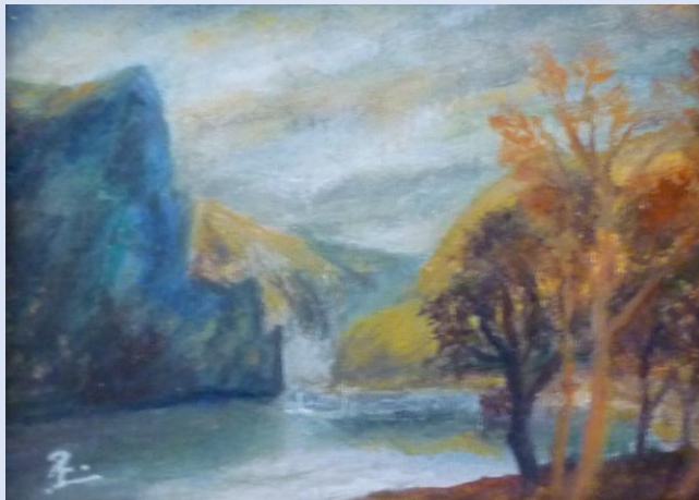
Oil on Wood, 4 x 5.5 cm