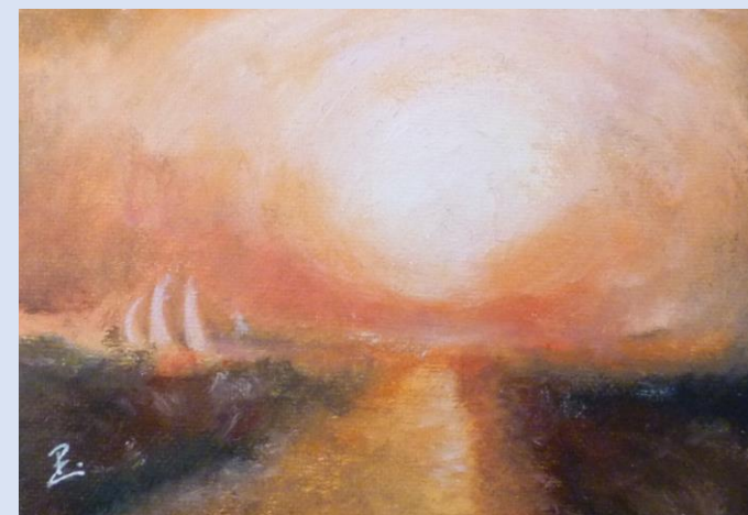
Oil on Linen, 5.7 x 7 cm

In this painting the light in the sky and on the sea dazzles the viewer, obscuring the scene. Dark shapes that appear through the layers suggest boats, while the buildings on the left have not been definitely identified but may represent Venice.