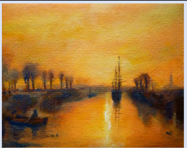
Oil on Canvas, 5.7 x 7 cm