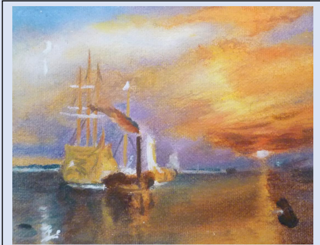
Oil on Canvas, 5.7 x 7 cm