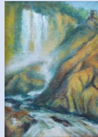
Oil on Wood. 5.5 x 4 cm

Turner made a short detour from the direct road to Rome on this 1817 trip in order to visit the famous waterfall. The whiteness of the waters led to the popular appellation of the 'Cascata' or 'Caduta delle Marmore', Falls of Marble.