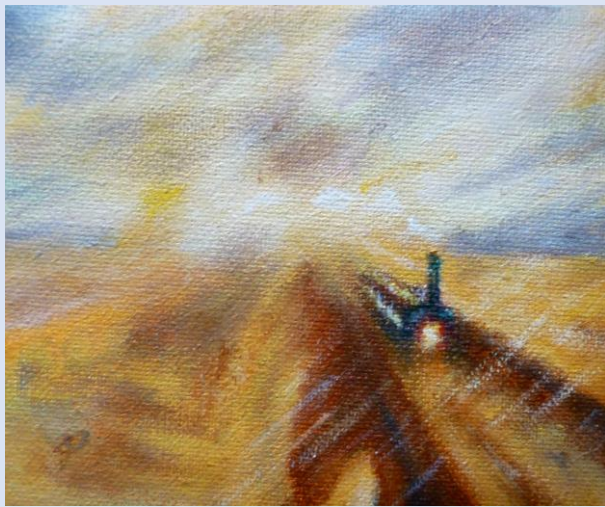
Oil on Linen, 5.7 x 7cm