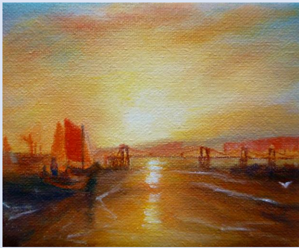
Oil on Linen, 5.7 x 7cm