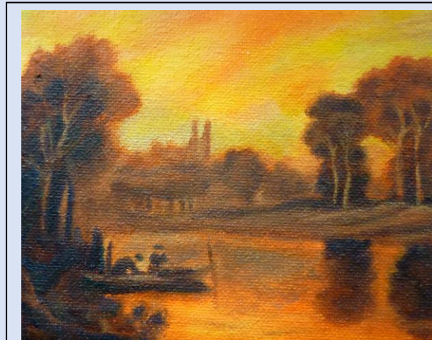
Oil on Canvas, 5.7 x 7 cm

The Figures in the punt on the left have a markedly Dutch look about them, deriving perhaps from the figures in Van Goyen's 'riverscapes'. Turner was to introduce Van Goyen into the title of one of his exhibited pictures twenty-five years later. (Tate)